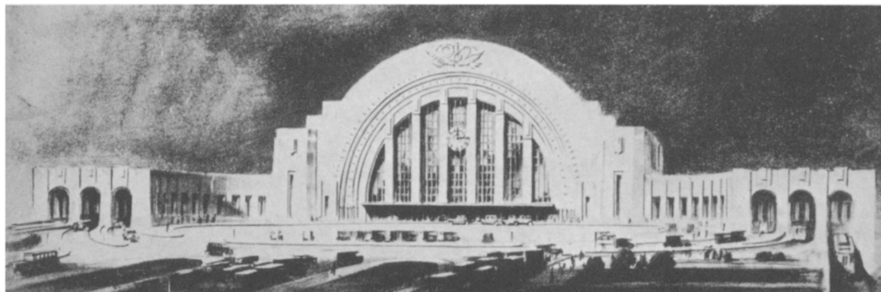
Cincinnati's Beautiful Terminal Station is a Model of Modern Art and Architecture