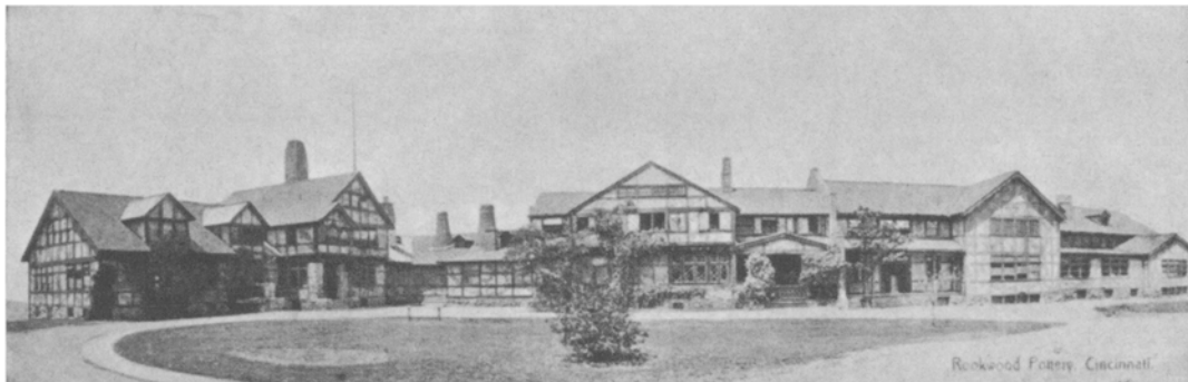
Rookwood Pottery, an Enterprise in Which Cincinnati Takes Great Pride